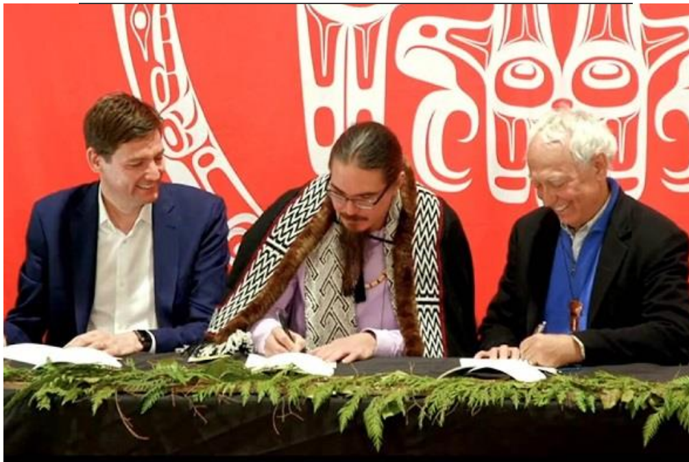
Premier David Eby, Haida Nation Council President Gaagwiis (Jason Alsop), and Minister of Indigenous Relations and Reconciliation Murray Rankin sign Haida Title Lands Agreement in Haida Gwaii on April 14, 2024.