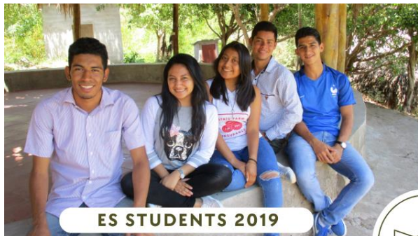
ES STUDENTS 2019